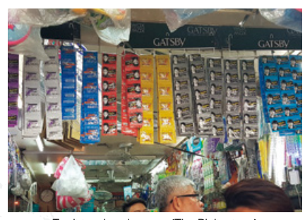
Traditional trade store (The Philippines)