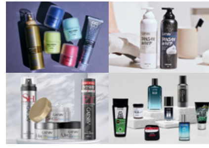
Men's cosmetics in Japan and overseas