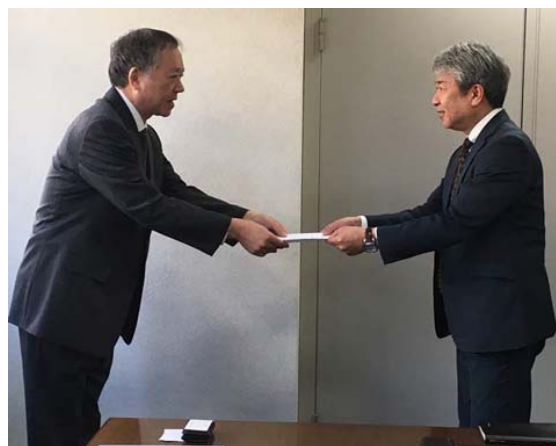
Special subsidiary authorization award ceremony

The Mandom Group accepts diversity and promotes “Diversity and Inclusion” so that individual employees can exercise his/her maximum potential and so that both the company and employees can grow. The company will work on human resource development and improvement of the working environment and structure to realize a company where all employees can develop their careers and